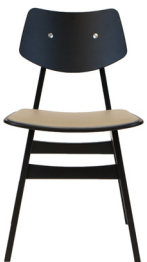
leather / textile mirror upholstery