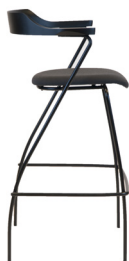
leather / textile seat