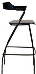
leather / textile mirror upholstery