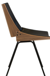
leather / textile seat + back