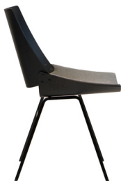
leather / textile seat