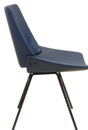
full leather / textile